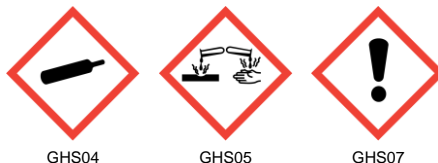
GHS04 GHS05 GHS07